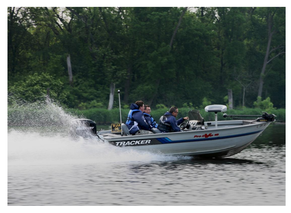
Above: Reavis High School—a reliable participant in the District 230 Tournament Series—cruises down the river to get to their 1<sup>st</sup> spot.