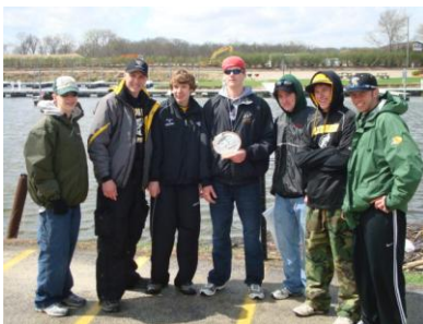
Above: The repeat District 230 champions after the 2 nd annual District 230 tournament!