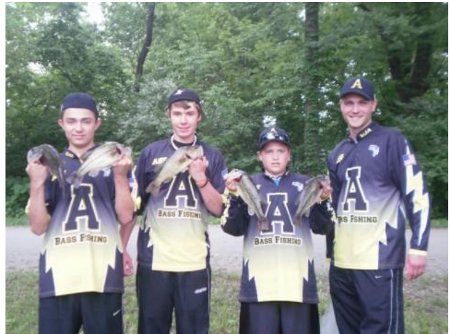
Above: The five-fish-limit that won the T-Bolts 1 st place is proudly displayed.