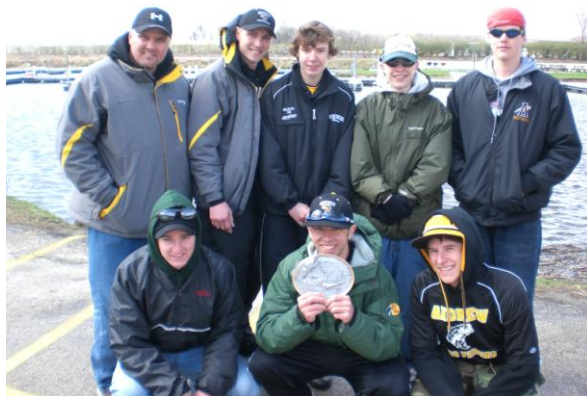
Above: The 2010 VJA bass fishing team hoists up their 1 st place trophy after the District 230 Fishing Tournament.