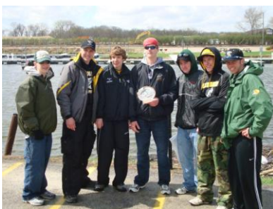
Above: The VJA anglers smile after a victory!